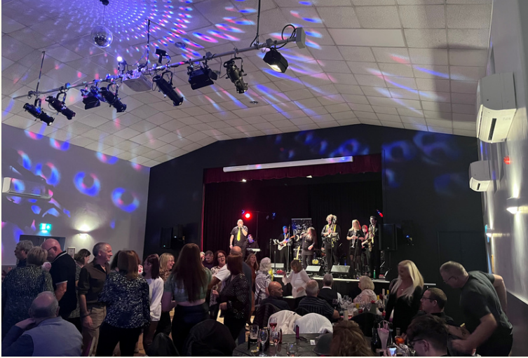
The Top Banana Band have everyone up on their feet